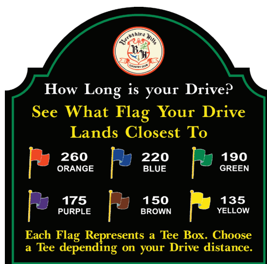
BERKSHIRE HILLS PRACTICE RANGE SIGN

Once traditional tee colors are changed, players will begin to better understand which tee markers they should play. One way to speed up your customers’ understanding is to place on the practice range flags that correspond to the tee colors with a sign, such as this one from the Berkshire Hills practice range in Chesterland, Ohio.